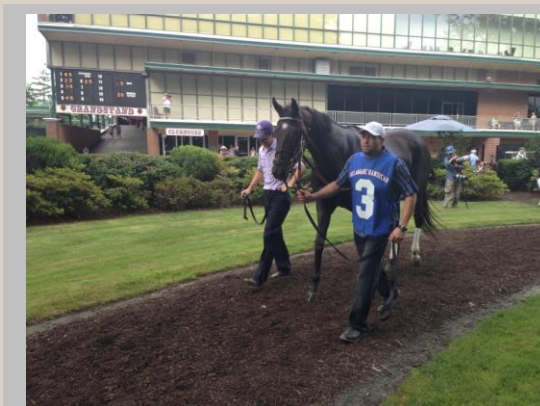
THE HORSES ARE COMING!