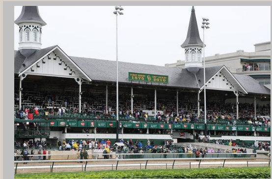
Churchill Downs is the site of the 2014 President of the UAE Cup S. (G1).

It has been announced that the President of the UAE Cup S. (G1) will be held on Saturday, June 14, 2014 at Churchill Downs in Louisville, KY on Stephen Foster Day, a Downs After Dark race day. The race will be worth $100,000 guaranteed, and will be open to all purebred Arabians 4-years-old and up. The race will be contested at 1 1/16 miles and the exact conditions for nominations will be announced at a later date.