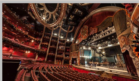
THE HISTORIC DOLBY THEATRE WILL BE THE LOCATION OF THE COVETED DARLEY AWARDS CEREMONY, SPONSORED BY HH SHEIKH MANSOOR BIN ZAYED AL NAHYAN GLOBAL ARABIAN FLAT RACING FESTIVAL ON FRIDAY, APRIL 4, 2014.