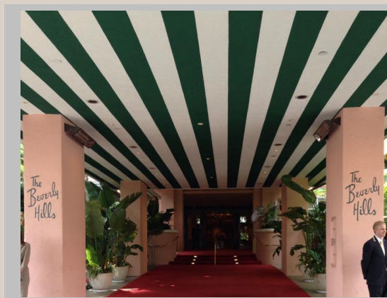
THE GALA DINNER, AN INVITATION ONLY EVENT, IS AT THE BEVERLY HILLS HOTEL ON SATURDAY, APRIL 5, 2014.