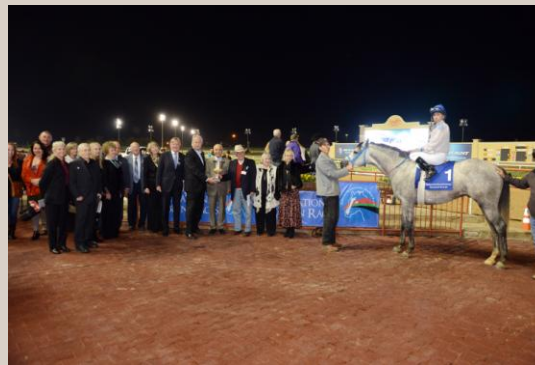
Jewell AA, U.S.'s leading 3-year-old by earnings finished her year in the winner's circle at Lone Star Park.

Once again, it shows that the most successful horses race at Delaware Park.